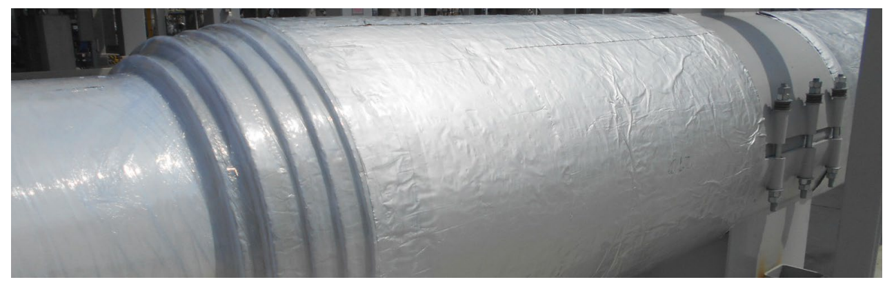
Flexible Industrial and Commercial Insulation for Sub-Ambient and Cryogenic Applications

Cryogel® Z flexible aerogel blanket insulation is engineered to deliver maximum thermal protection with minimal weight and thickness. Unmatched in sub-ambient, cold cycling and cryogenic applications. Cryogel® Z incorporates an integral vapor retarder with zero water vapor permeance to ensure maximum asset protection.